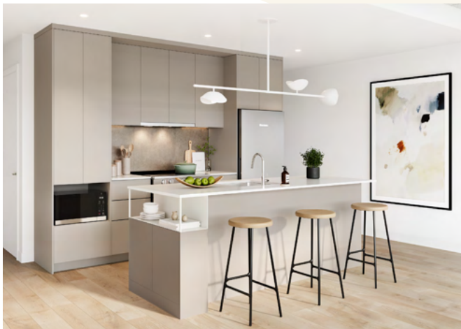
Color 1 / Minimalist and sleek, this kitchen and bathroom emphasize simplicity and tranquility while remaining elegant and sophisticated.