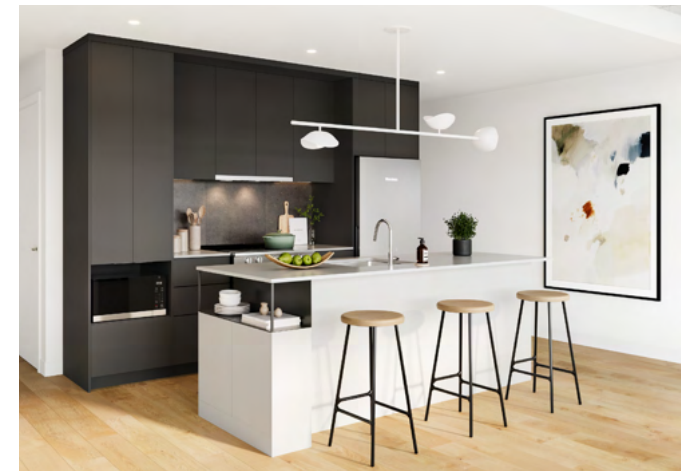
Color 2 / A space where natural materials and concrete meet. The wooden accents bring warmth and authenticity, while the concrete adds a modern and sturdy touch.