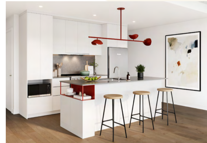
Colo 5 / A bold and dynamic design, featuring contrasting materials and colors that bring energy and character to your space.