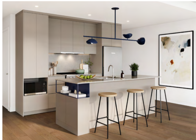
Color 4 / A kitchen with smooth, clean lines that evokes the calm of a serene river. Perfect for those seeking a peaceful and harmonious atmosphere.