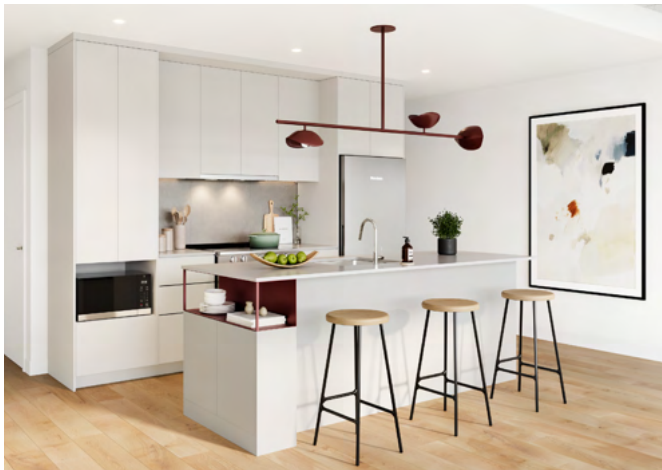
Color 3 / A design that is pure, practical, and inspiring, creating an environment conducive to relaxation.

A well-thought-out and thoughtfully designed home